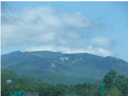
The Cliffs of Welch and Dickey